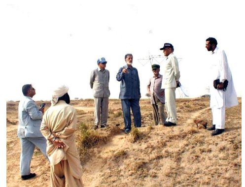
KEF Board of Trustees visiting the project site May 2002